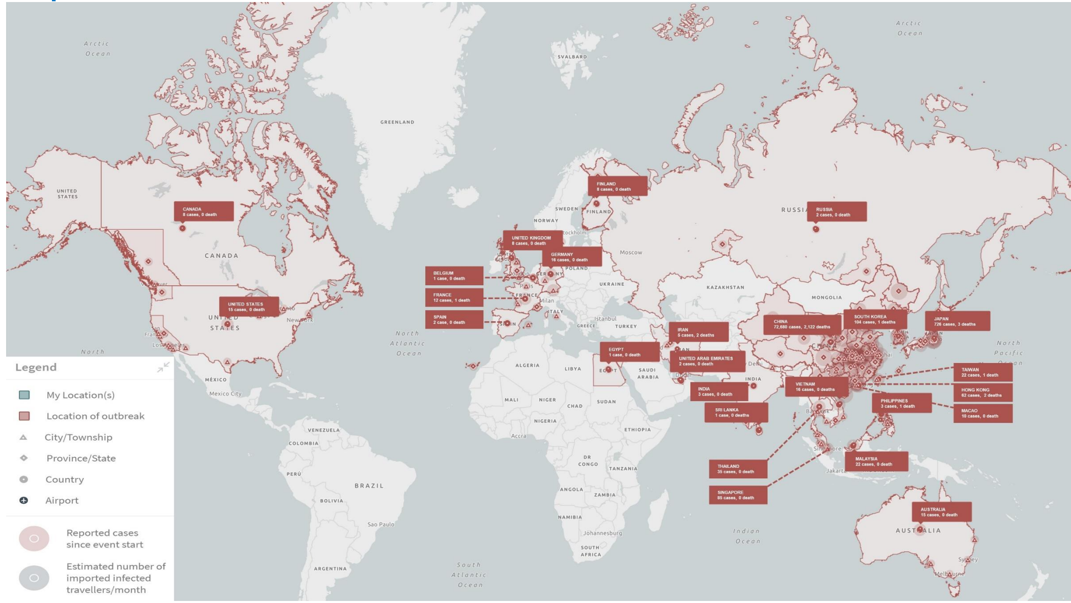
Figure 1. Global map of countries with COVID-19 confirmed cases as of February 21, 2020 (2 PM GMT+8)