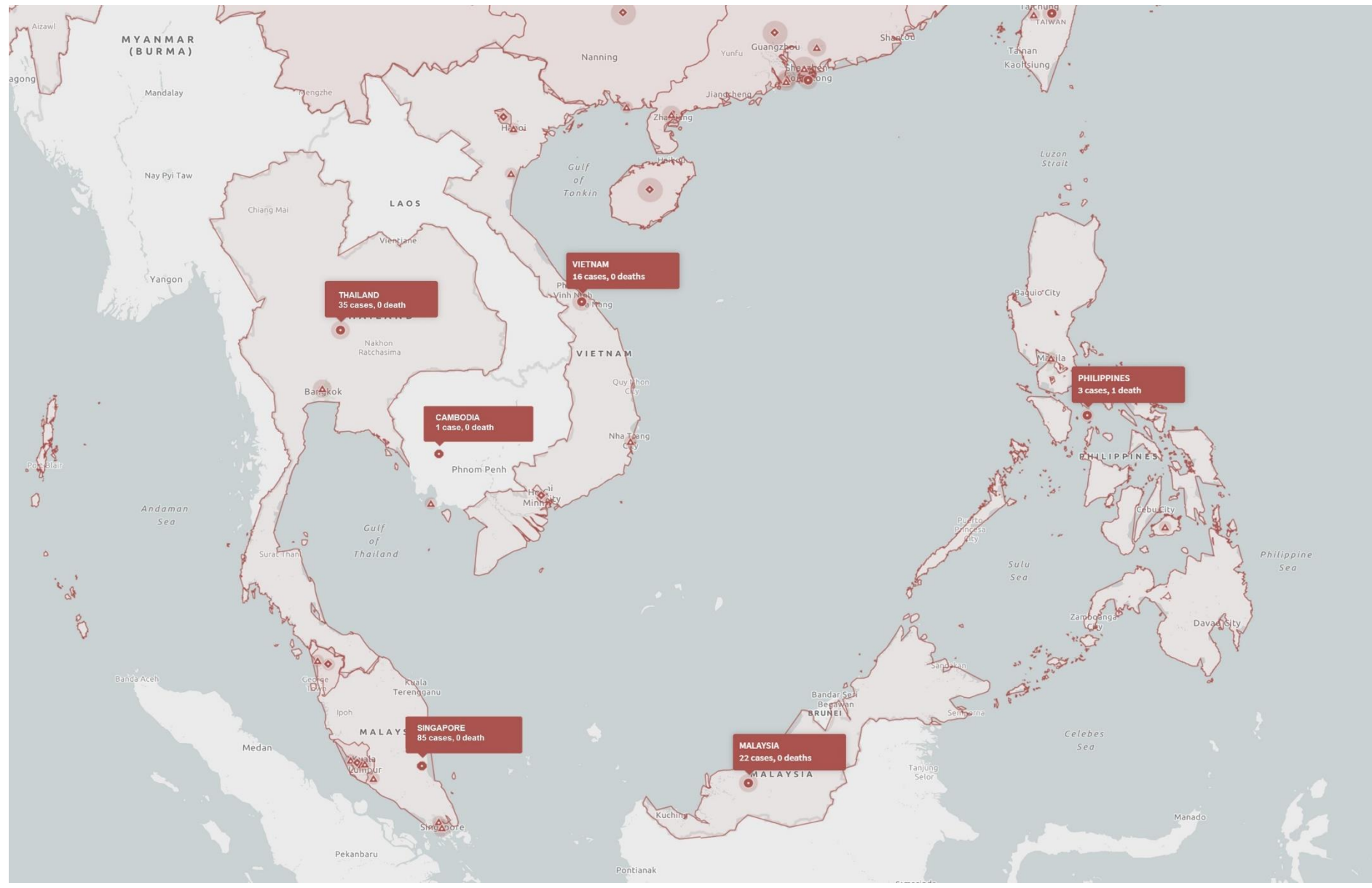
Figure 2. ASEAN Region with COVID-19 confirmed cases as of February 21, 2020 (2 PM GMT+8)